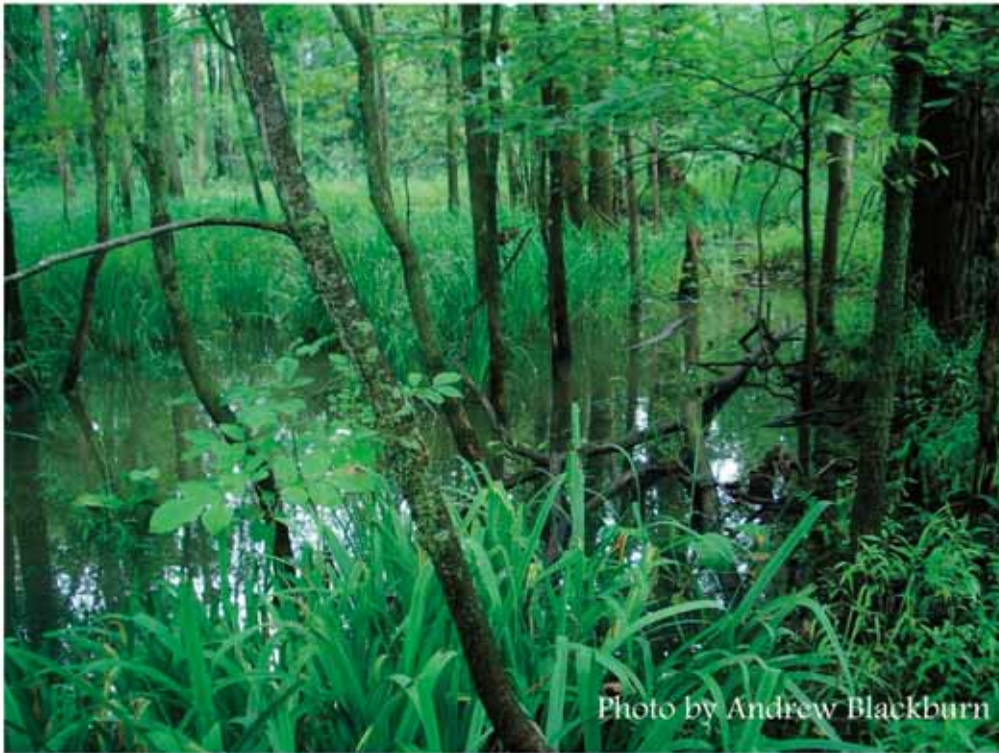
Midsummer greenery at Little Calumet Wetlands

near Chesterton in Porter County is our newest project area. The Little Calumet River bisects the property, making it a great spot for outdoor activities like paddling, fishing, and hiking.