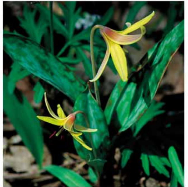
Yellow trout lily