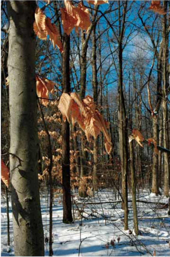
Barker Woods in winter