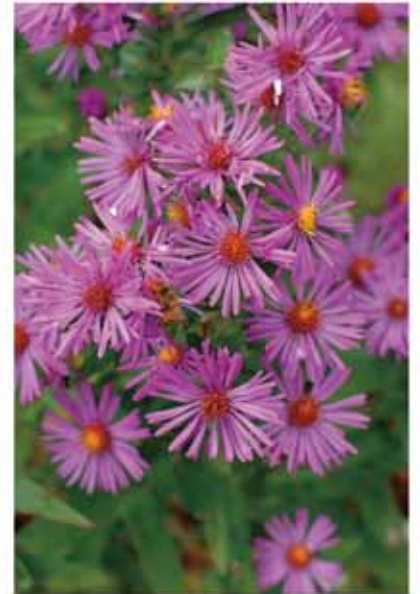
New England asters