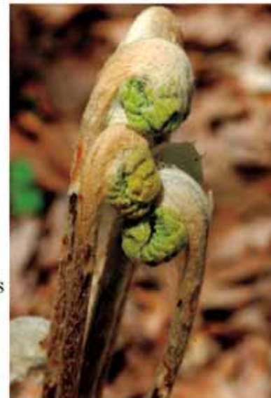
Fern fiddleheads about to unfold their fronds