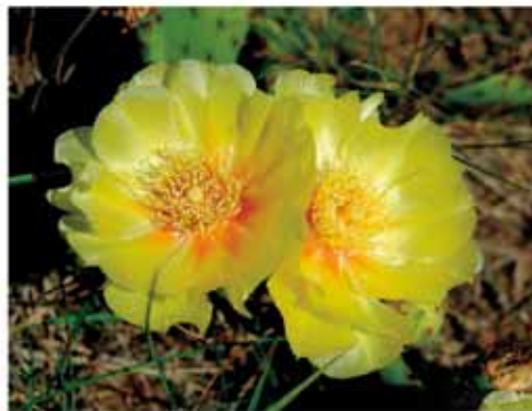
Prickly pear cactus