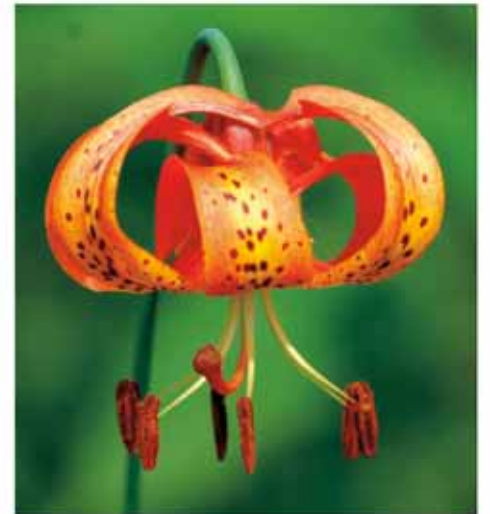
Turk's cap lily