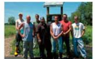
Green Jobs Work Crew at Cressmoor Prairie