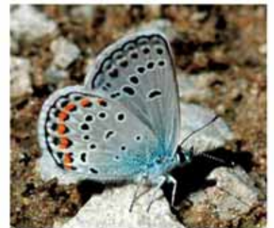
Karner blue butterfly