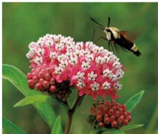
Hummingbird moth on swamp milkweed