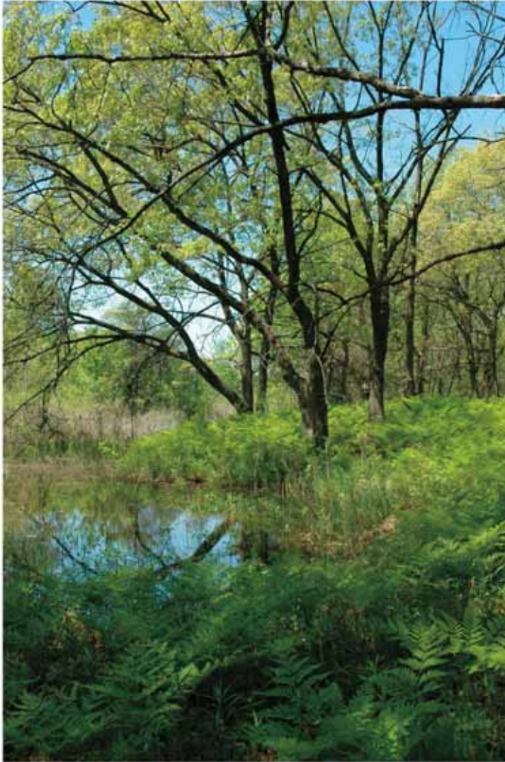
Spring at Ivanhoe South

is a globally rare landscape typified by a series of sandy ridges (dunes) alternating with long narrow wetlands (swales), all running parallel to the Lake Michigan shoreline. This rich habitat is preserved at Ivanhoe South in Gary and Seidner Dune & Swale in Hammond.