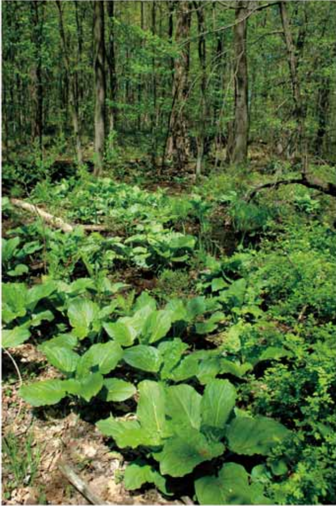
Wetland in spring

is a special kind of woods found in Indiana only in LaPorte County. Featuring many rare species and plants typical of a more northern climate, this 350-acre property is a dedicated state nature preserve.