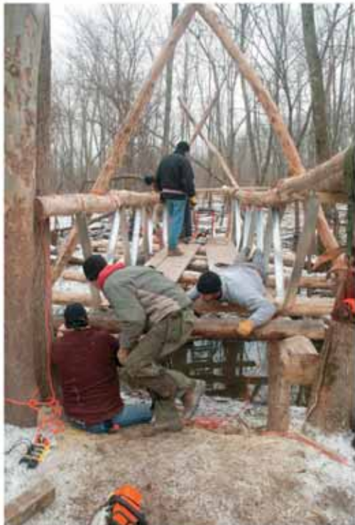
Building a bridge to improve public access