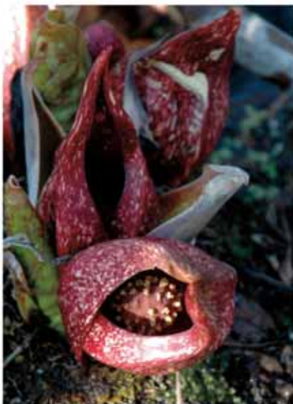
Skunk cabbage revealing its tiny yellow flowers