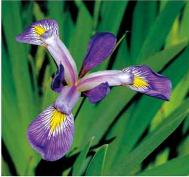
Blue flag iris

exists on the dune-and-swale landscape, where wetland, savanna, and prairie communities meet.