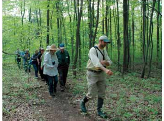
Guided nature walk at Ambler Flatwoods