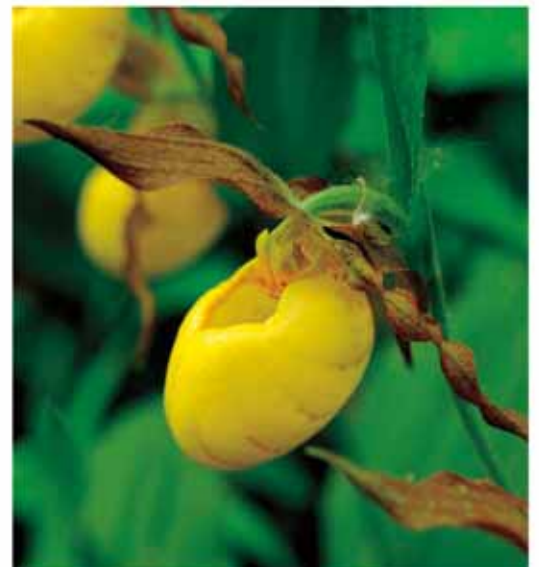
Yellow lady's slipper