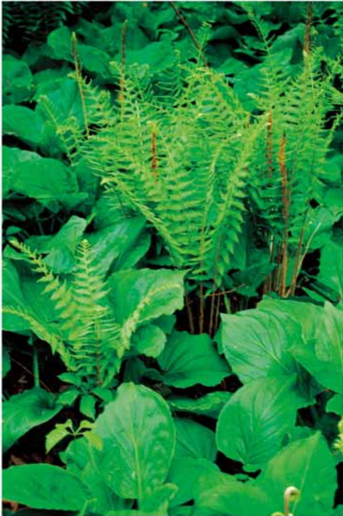
The lush growth of April at Yellow Birch Fen in Porter County

comes early, as skunk cabbage pushes it way up through the mud, frogs begin calling, and birds arrive from their winter homes.