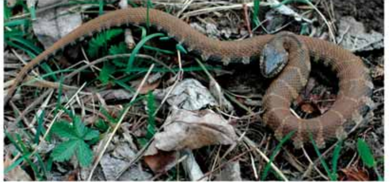
Northern water snake