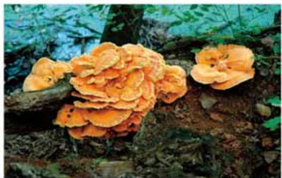
Sulphur shelf fungus