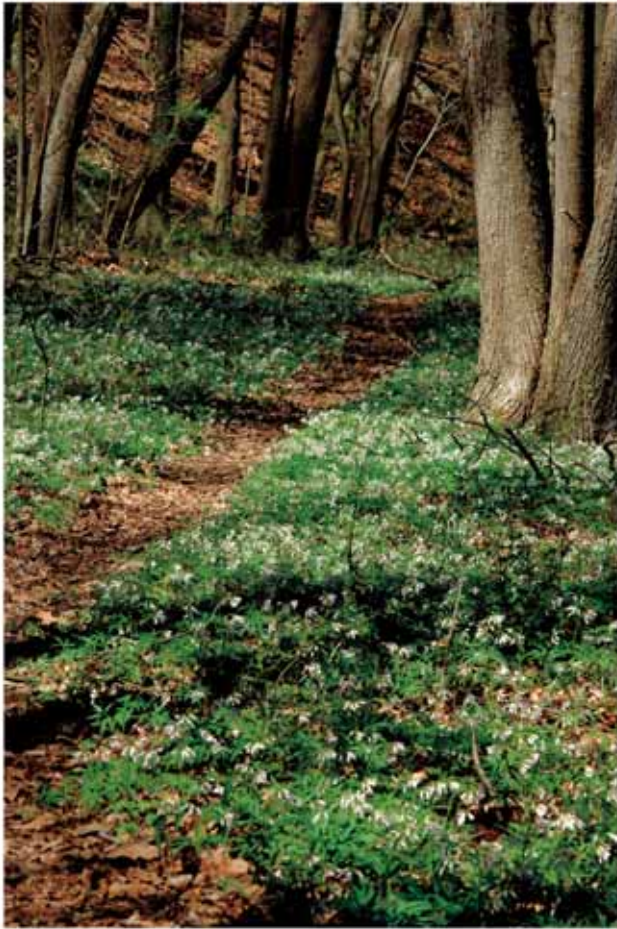
A blanket of toothwort borders the trail at Hildebrand Lake.

burst into bloom on the forest floor each April and May.