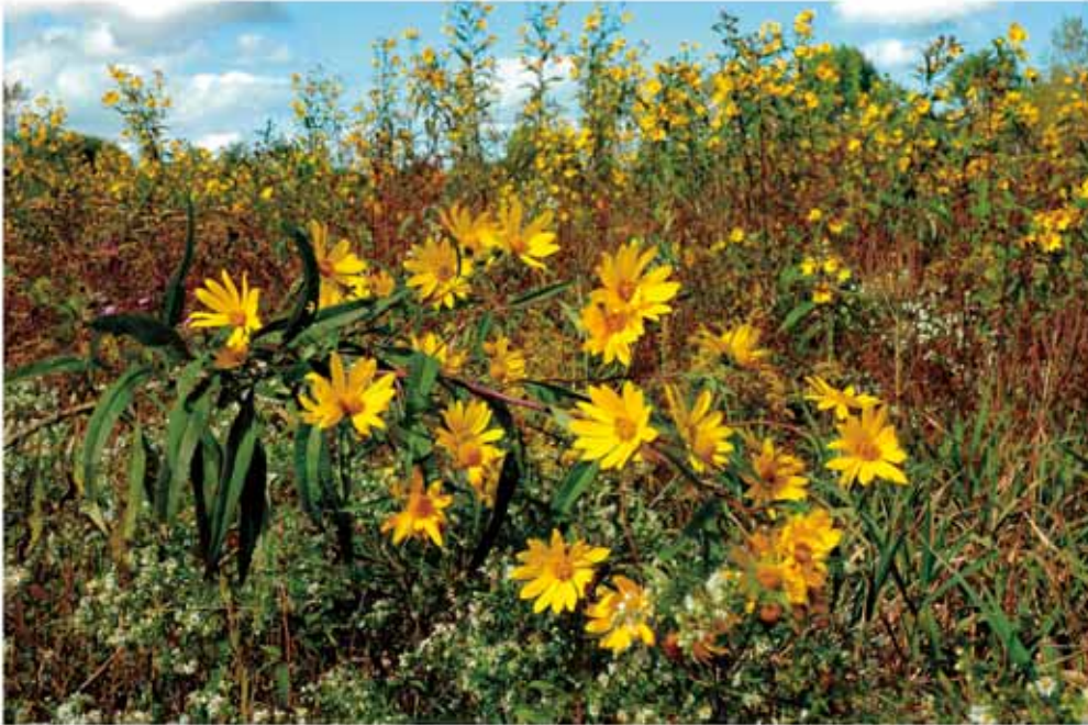
Late summer in the tallgrass prairie

once stretched from Indiana to the foothills of the Rockies. After a decade of restoration, Cressmoor Prairie is beginning to look as it might have two centuries ago.