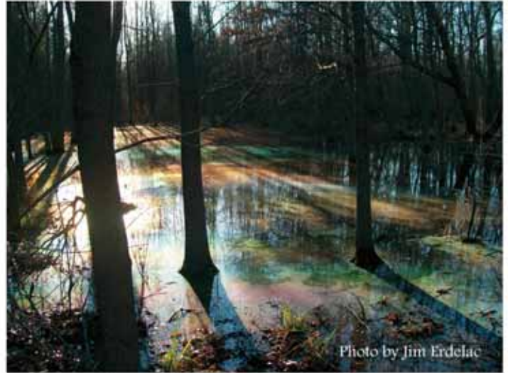
Low afternoon sun in winter