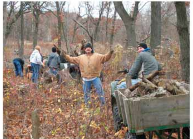
Volunteer workday at J.M. Coulter Preserve