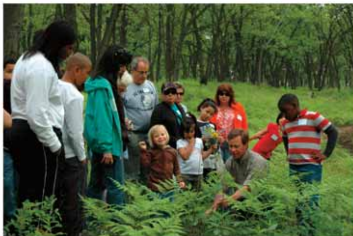
Outdoor learning laboratory at Ivanhoe South Nature Preserve